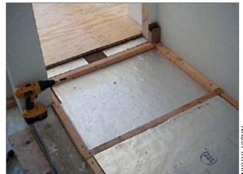
The floor is built up in two layers of insulation. Infiltration is eliminated at the critical points.