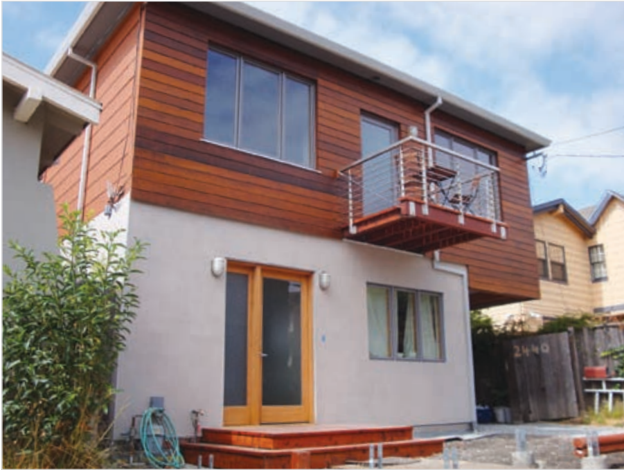
The new street facade on the Tahan home in Berkeley was created with the original redwood siding as a rainscreen on the second floor.