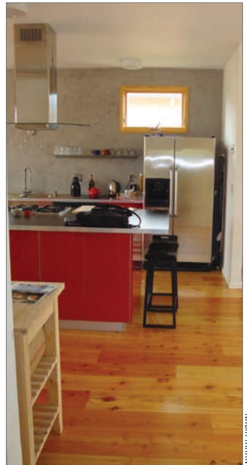
The kitchen has a recirculating fan to recycle heat.