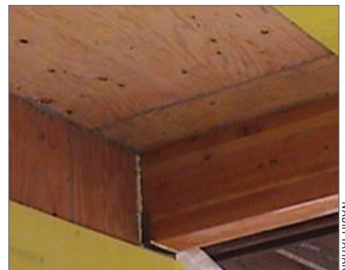
Calking and foam create an airtight layer.